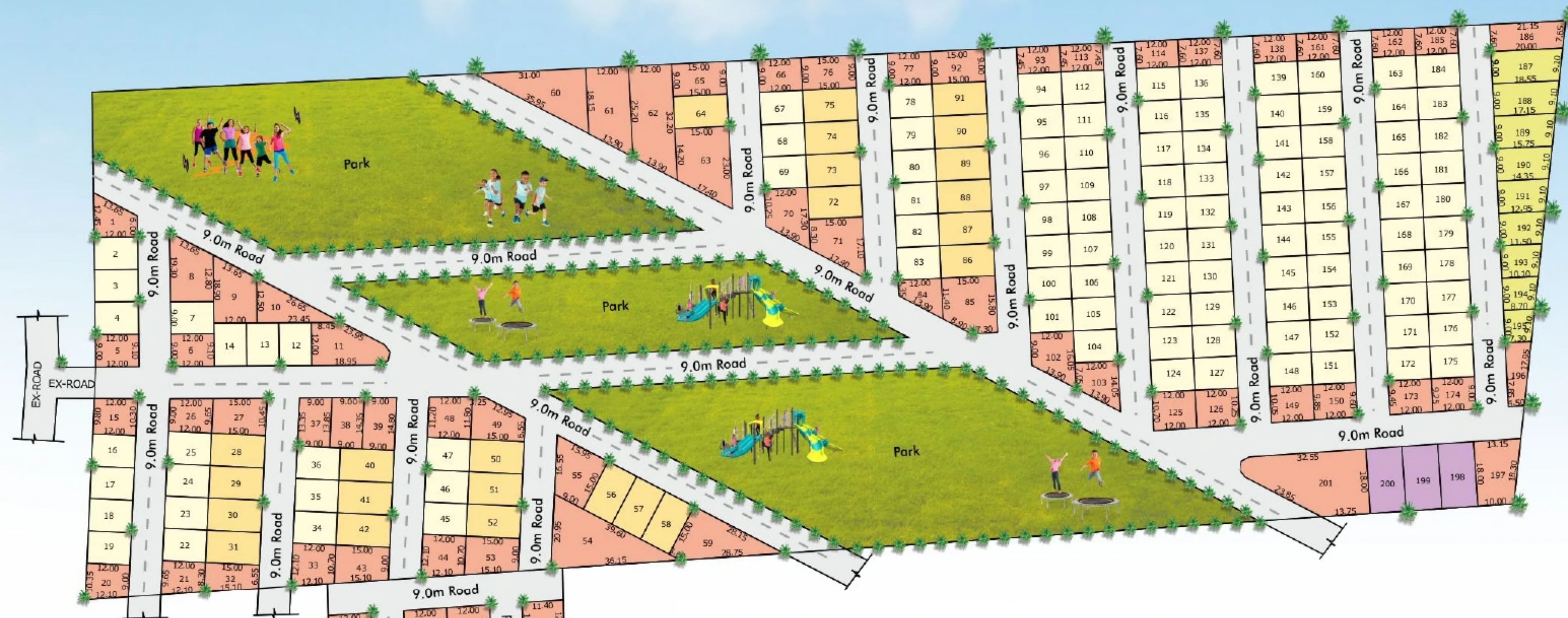
PROPOSED RESIDENTIAL LAYOUT : AT GOKUL VILLAGE, HUBBALLI